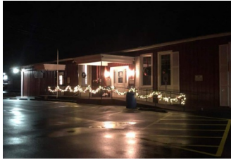
A before picture of our beloved Village Hall & Library building after Light Up Barker, December 2018