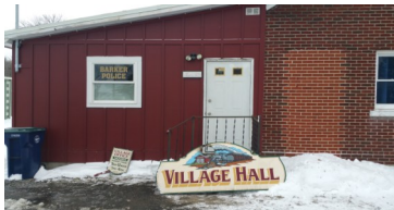
The our new location at 1697 East Avenue. This is where you will do any business associated with the Village. Pay water bills, notify, building permit etc.