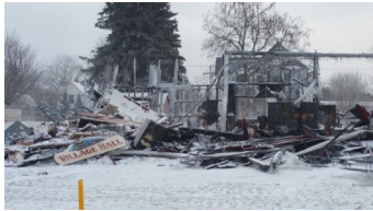
An after picture of the debris left from the tragic fire of January 20, 2019