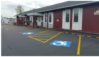
A before picture of our beloved Village Hall & Library building in October 2018